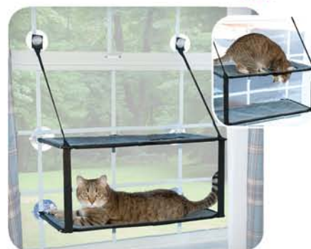
pictured: Kitty Sill - Double Stack EZ Window Mount™